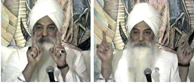
See video down in the lecture

Let us see, if we can reach. This exercise is very funny. It's not hard, mind you.